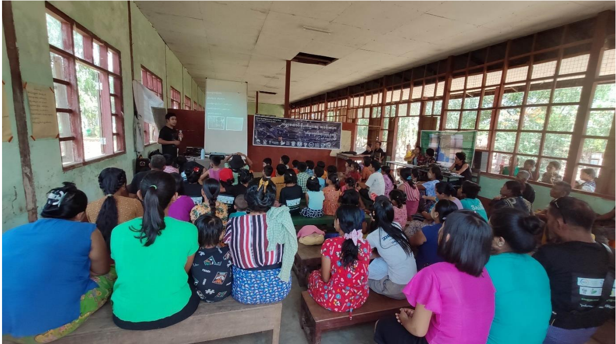
Photo 5: Presentation on the conservation of migratory birds and wetlands