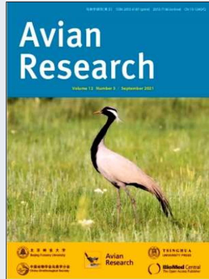
Avian Research (2021)

ELEVENTH MEETING OF PARTNERS TO THE PARTNERSHIP FOR EAST ASIAN – AUSTRALASIAN FLYWAY Meeanjin/Brisbane, Queensland, Australia, 12-17 March 2023