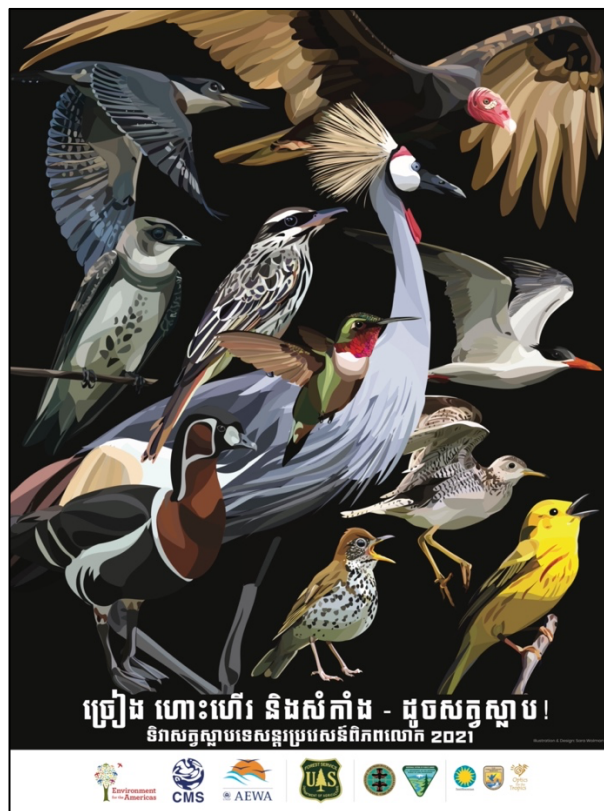
Translated WMBD 2021 poster into Khmer language

To date, Ministry of Environment Cambodia have nominated Anlung Pring Protected Landscape as the first Flyway Network Site (FNS). The Anlung Pring Protected Landscaped is located in Boeung Salang Kang Tbaung and Prek Kruss communes, Kampong Trach district, in Kampot Province, and adjacent to the international border between Cambodia and Vietnam. Each year, this wetland plays a significant role in hosting large numbers of Sarus Crane and other migratory birds from December to May during the non-breeding season for those species. However, it is needed to promote and awareness of the conservation of migratory birds, their flyway as well as to encourage the local authorities on nominated the important wetlands that support migratory birds as FNS for further promotion, conservation and exchange good management model with other FNS along the East Asian Australian Flyway.