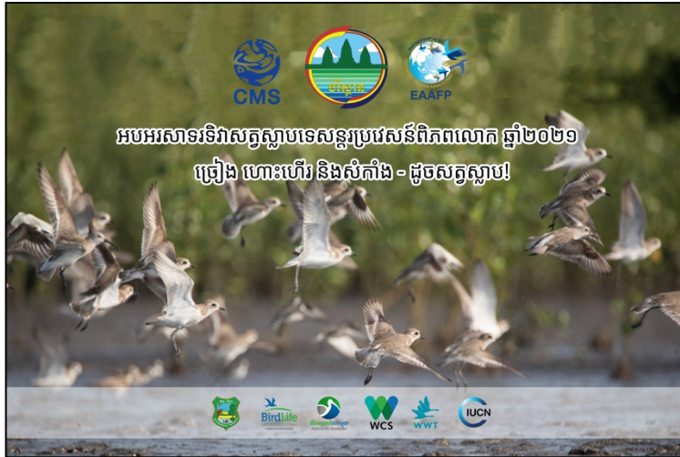
Designed image for website posting and dissemination