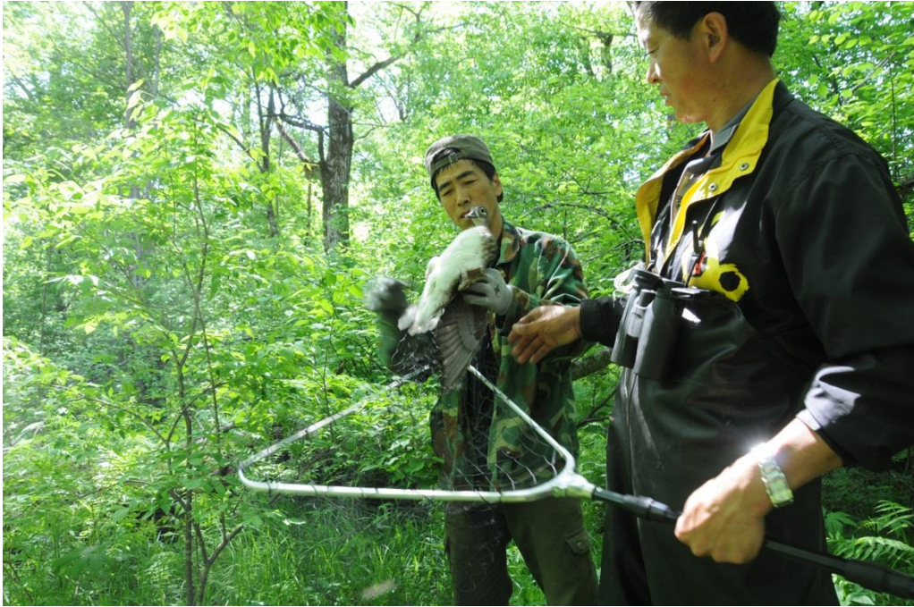
We caught a Mandarin Duck in Nest 16