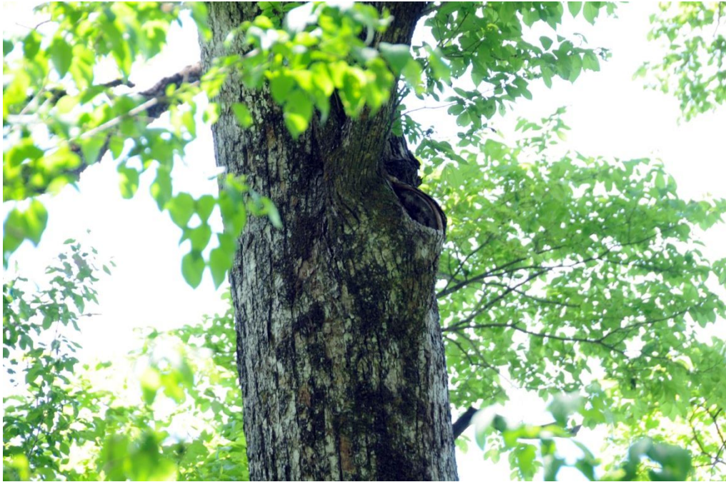
The nest SSM female used in 2013