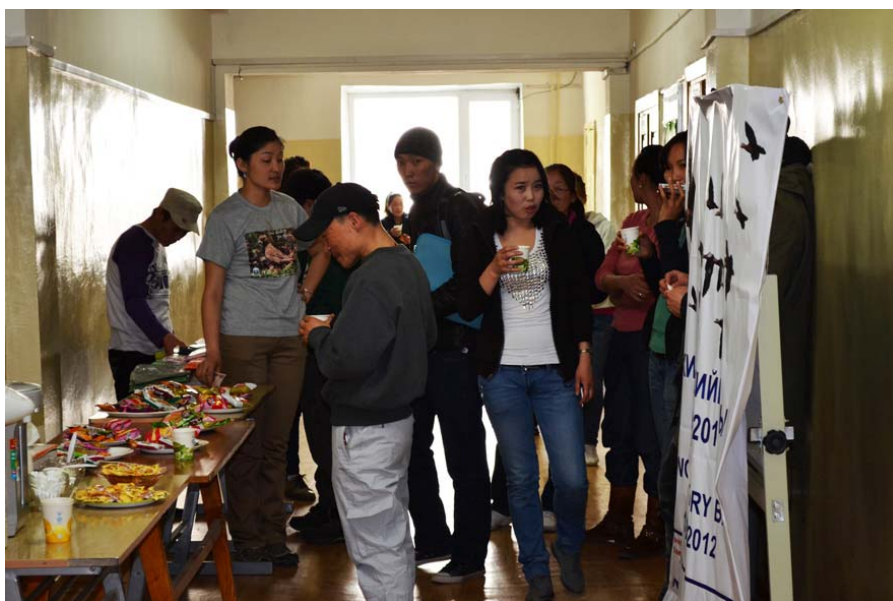
Coffee break during the event

After the presentations, all participants had a tea and coffee break and had a free discussion on different issues of migratory birds. Then all participants chose to discuss one of two options of documentary film “Oriental Honey-buzzard in Taiwan” and “Life” by the BBC. The majority of participants chose to watch and discuss the “Life” Documentary serials. A short translation and explanation of the documentary were given to all participants by Dr. S. Gombobaatar during the film screening.