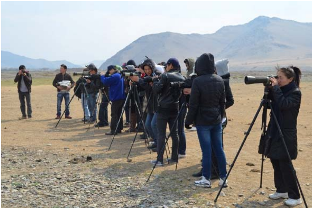
The competition of Bird identification during the event at the pond