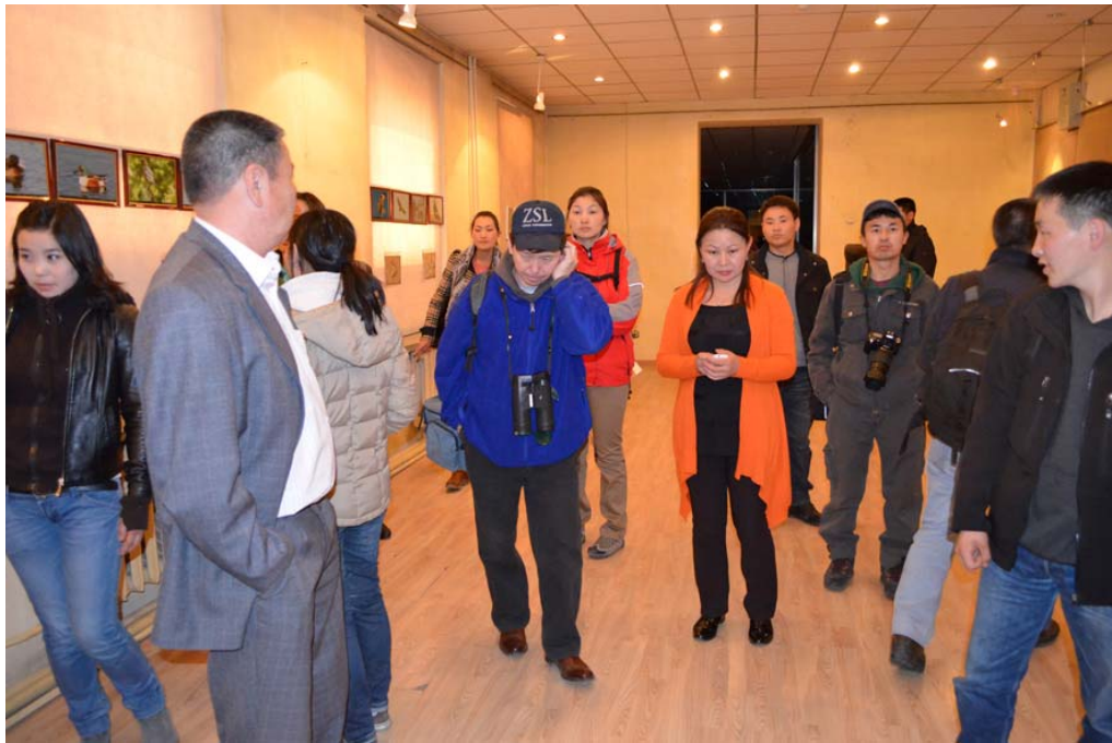
Organizing Committee members