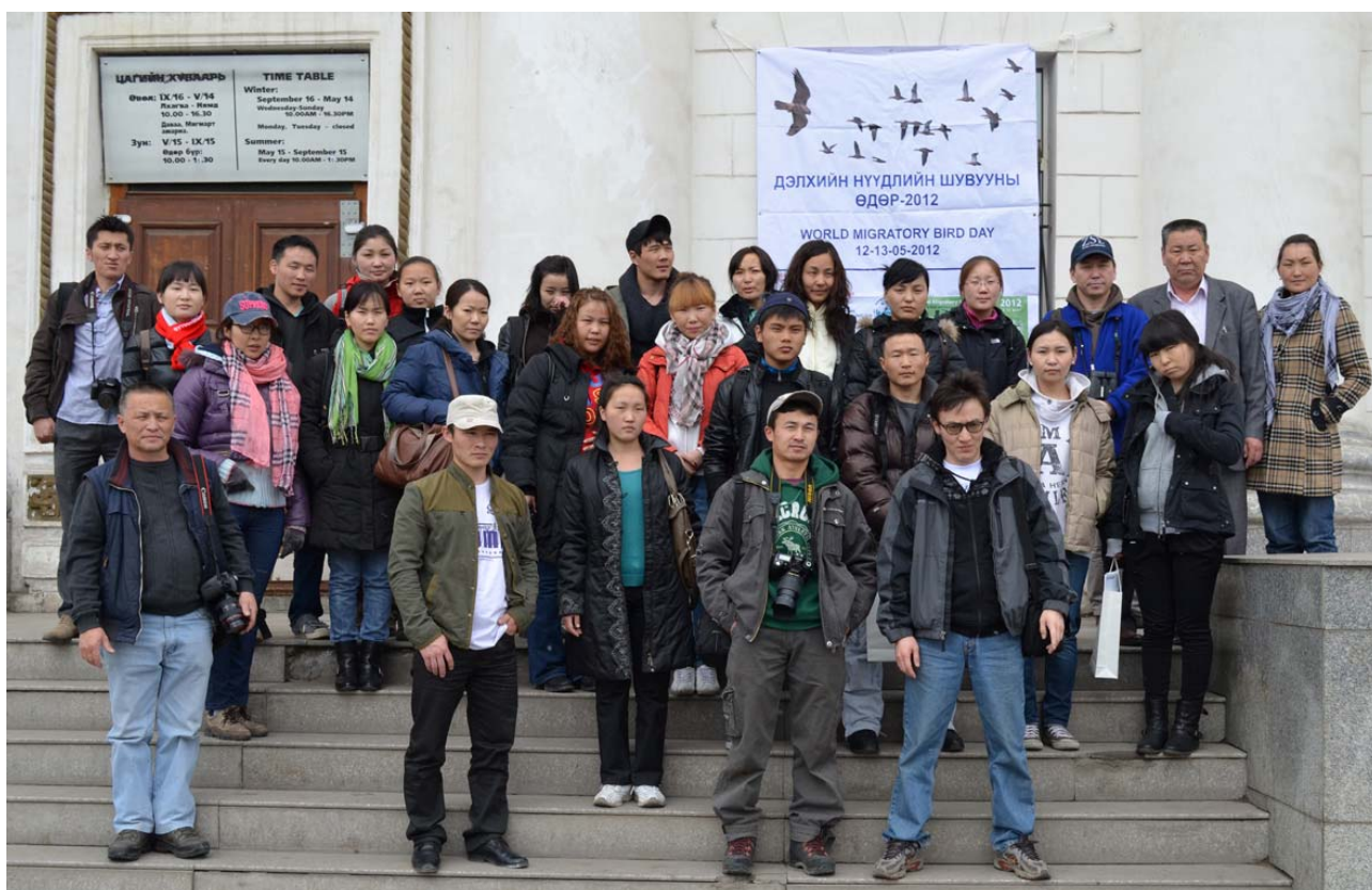
World Migratory Bird Day-2012 in Ulaanbaatar, Mongolia Ulaanbaatar 12 May, 2012

In collaboration with the Ministry of Nature, Environment, and Tourism, Natural History Museum of Mongolia, East-Asian Australia-Asian Flyway Partnership, UNEP/CMS Secretariat World Migratory Bird Day Coordinator, and Steppe Forward, the Mongolian Ornithological Society and Ornithological Laboratory at the National University of Mongolia successfully organized the World Migratory Bird Day in Ulaanbaatar, Mongolia on 11-13 May, 2012.