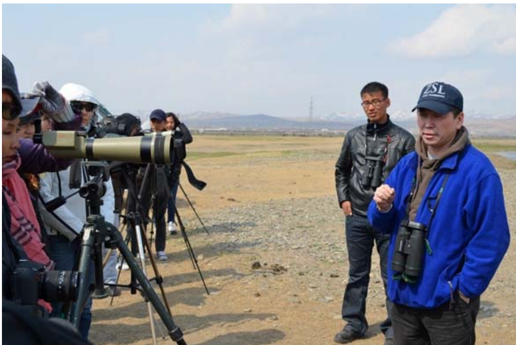
During the competition of bird identification