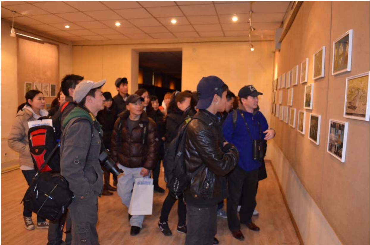
The participants in the exhibition hall at Natural History Museum

The Natural History Museum and Mongolian Ornithological Society opened a photograph exhibition on “Migratory Birds of Mongolia” and “The National Bird of Mongolia” for the event WMBD-2012, Mongolia. The participants went to the exhibition and enjoyed the migratory bird photographs taken by members of the Mongolian Ornithological Society.