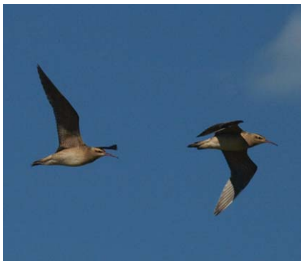
Little Tern and Little Curlew